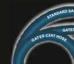
Illustration of GATES 1/2" Reduced Hose Length

Note : Gates also offers several other hoses for special applications. To find out the hose suitable for your application, please contact us.